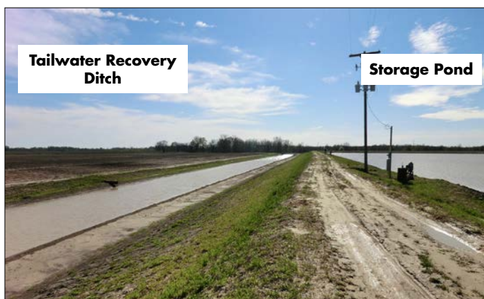
Figure 1. An on-farm water storage system typically consists of a pond and a tailwater recovery canal.

An on-farm water storage (OFWS) system is a structural best management practice that captures and stores surface water runoff so that it can be used at a later time for irrigation. These systems can capture runoff both from rainfall and tailwater from furrow irrigation, and they can be constructed with only a storage pond, with an enlarged tailwater recovery (TWR) ditch, or with a TWR ditch and a storage pond ( Figure 1 ). The pond is typically constructed on an area of the farm that is less productive, such as a low-lying area that does not drain well. The TWR ditch and pond are positioned where they can capture adequate runoff yet remain accessible to fields that will be irrigated using the stored water. The designs of the systems vary depending on where in Mississippi they are installed. It is important to note that Section 404 of the Clean Water Act (CWA) requires a permit for the discharge of dredged or fill material into waters of the United States, which includes wetlands.