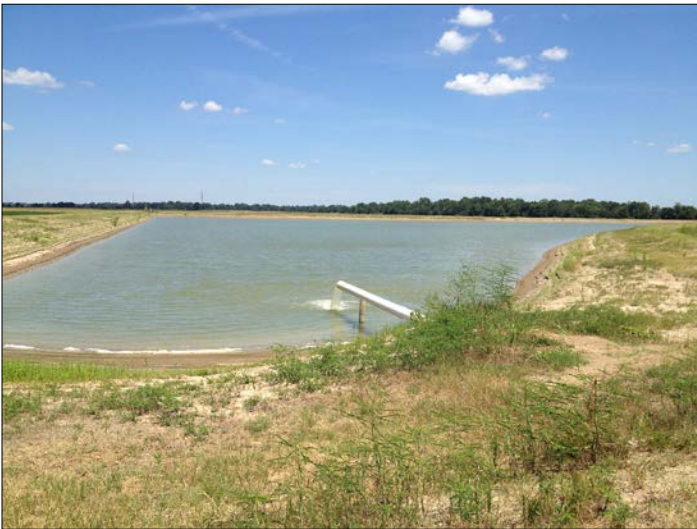
Figure 3. On-farm water storage pond.

Due to the flat terrain in the Mississippi Delta, fields are usually precision-leveled, and pads and pipes are installed to ensure that runoff from surrounding fields drains into the TWR ditch. From there, it is pumped into the storage pond, where it is held until needed for irrigation. The storage pond is typically built up from soil captured through the land-leveling process, with minimal excavation. OFWS systems that are constructed with financial assistance from the NRCS are usually designed by an NRCS engineer to have a ratio of 1 acre storage for every 16 irrigated acres. Storage ponds are usually around 8 feet deep with a 4-foot berm and a minimum 6-inch overflow pipe ( Figure 3 ).