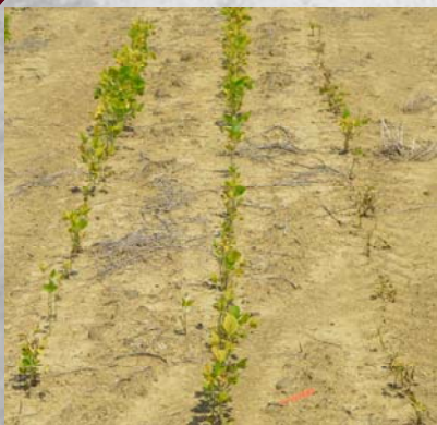
IDC Susceptible variety pictured for comparison

*Tolerance scores were assigned on a scale of 1 to 10, with 1 being completely tolerant and 10 being completely susceptible.