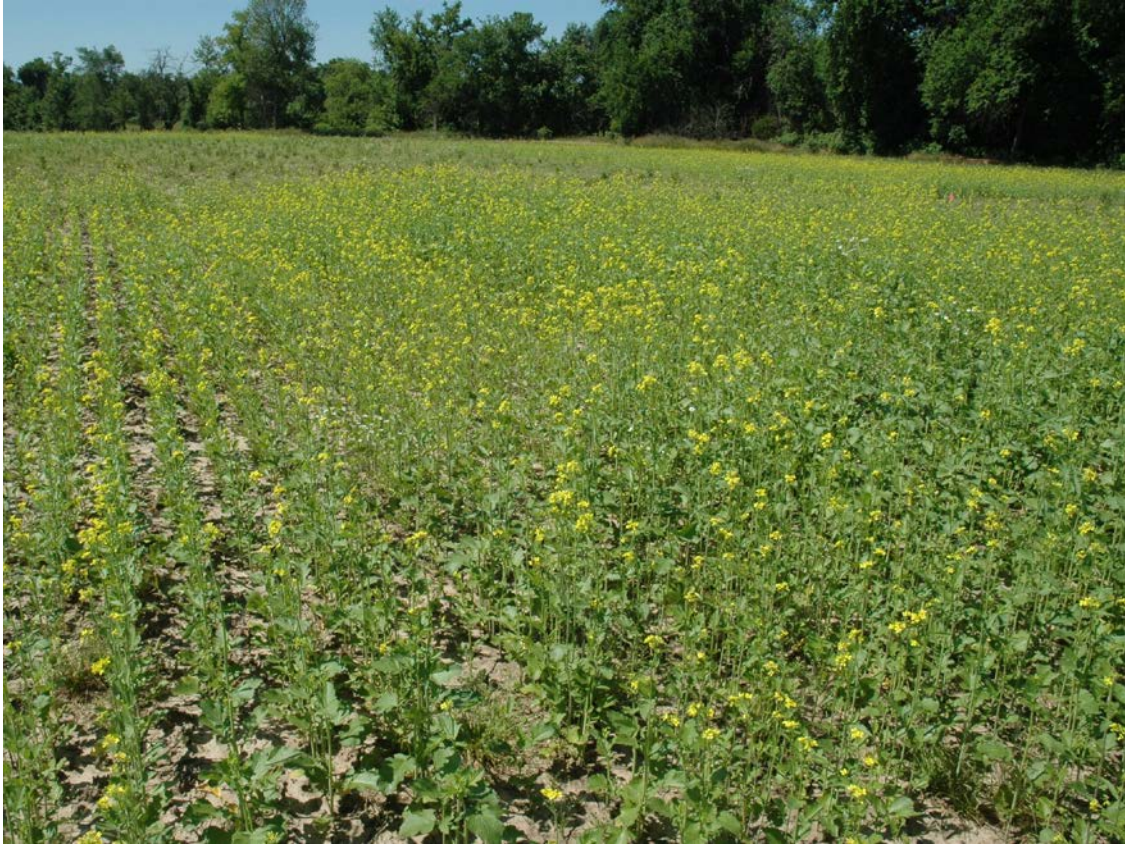
Figure 2. Might Mustard ( Brassica juncea ) planted as a cover crop prior to soybean planting.