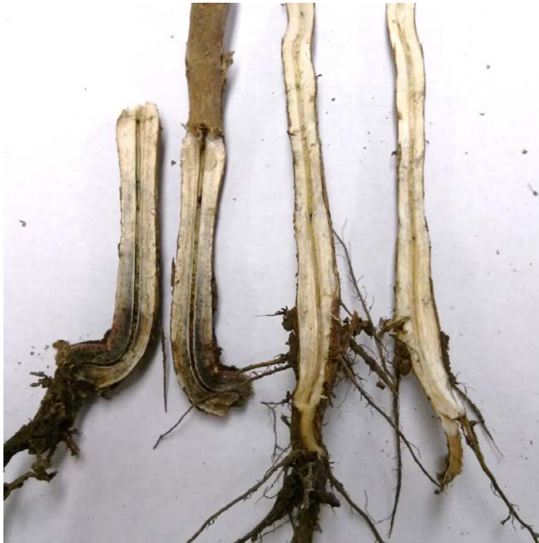
Figure 1. Charcoal rot, caused by the fungus Macrophomina phaseolina causes a grey, charcoal-colored growth in infected soybean roots. The plant on the left is highly infected. The plant on the right has minor infection. As the disease progresses, the roots atrophy and die, limiting seed development and reducing yield.