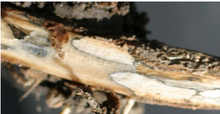
Figure 4. Stems affected by pod and stem blight may have visible black streaks or lines.

moisture drops. Seeds will not become infected once moisture is below 19 percent. However, during periods of wet and warm weather, seed infection and colonization can continue or resume if seed moisture increases to more than 19 percent. Therefore, delayed harvest can increase the risk of Phomopsis seed decay.