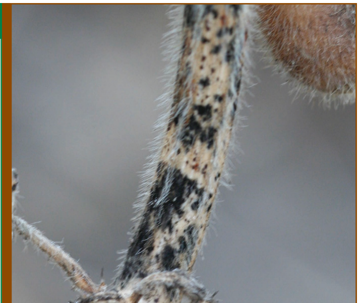
Figure 7. Saprophytic fungi produce dark structures on soybean stems that resemble symptoms of pod and stem blight.

Laboratory diagnosis may be needed to distinguish saprophytic fungi from pod and stem blight.