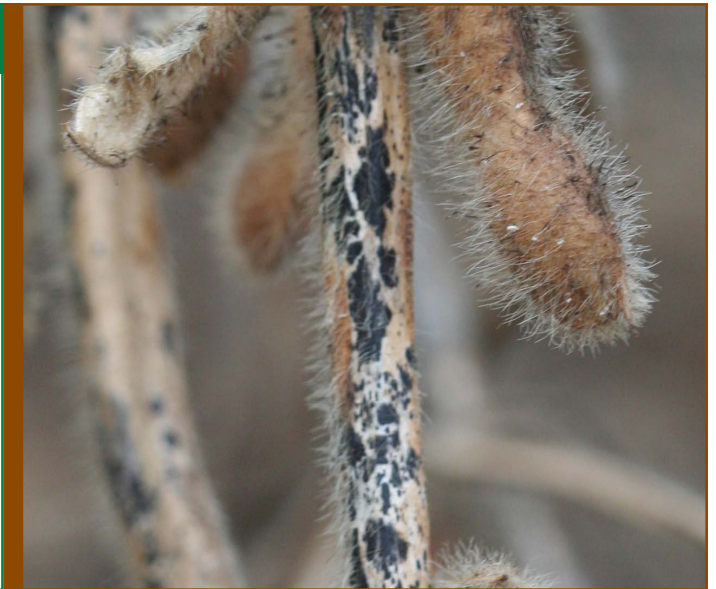
Figure 5. Large, irregular dark blotches on soybean stems are a common symptom of anthracnose.

With anthracnose-affected plants, the black specks and blotches on the stems do not occur in lines. The characteristic signs of the anthracnose fungus can be seen when viewed under magnification.