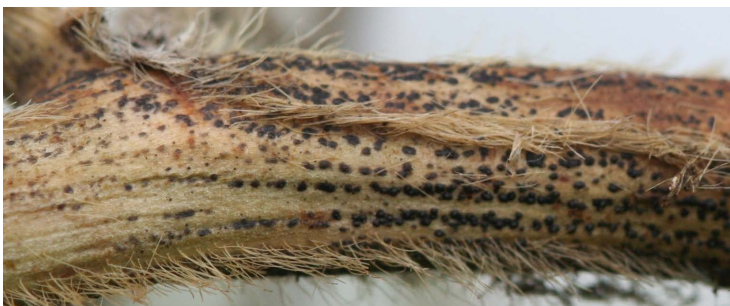
Figure 1. Linear black dots (pycnidia) along soybean stems are indicative of pod and stem blight.

Pod and stem blight is characterized by black, raised specks that appear in linear rows on mature soybean stems (Figure 1). These specks are fungal reproductive