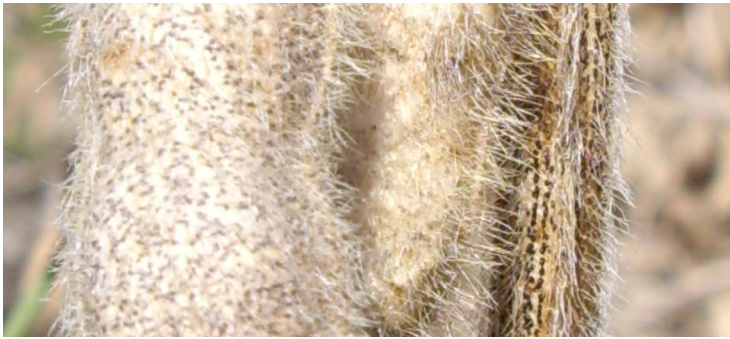
Figure 2. Pycnidia on soybean pods indicate infection by the pod and stem blight fungus.