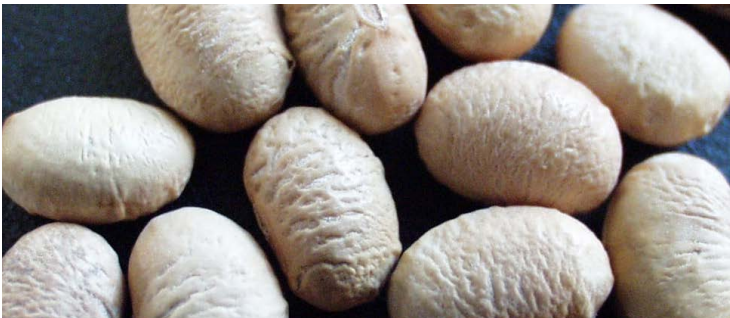
Figure 3. Soybean seeds that have white chalky mold may have Phomopsis seed decay.