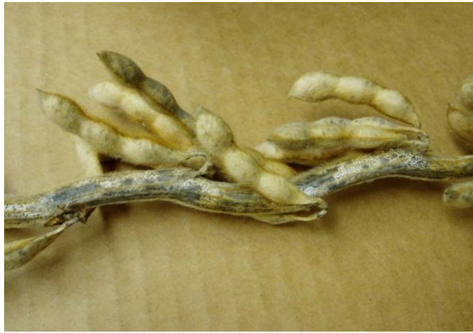
Figure 1. Pod and stem blight on soybean stem and pods.

Infection may occur early in the season without any definite, visible lesion development on leaf, stem, petiole or pod in the lower canopy. Late in the season (R7), small, black, flask-shaped fungal fruiting bodies called pycnidia occur in linear rows on lower stems, petioles, and pods, confirming early season infection (Fig. 1 & 2). Seeds within pods containing pycnidia are usually infected, thus reducing seed quality. Occasionally, bright red to brown lesions develop on cotyledons or hypocotyl (at or near soil line) of seedlings from infected seed.