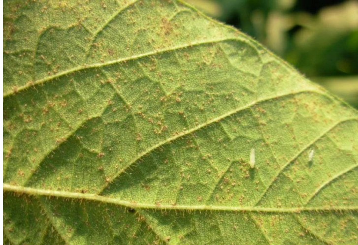
Figure 2. Numerous soybean rust pustules on the lower leaf surface of a soybean leaf.