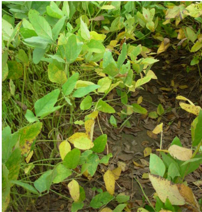
Figure 3. Defoliation of soybean leaves caused by soybean rust.

Soybean is the most important agronomic host of P. pachyrhizi , but the fungus can parasitize several other members of the Fabaceae (legume) family including kudzu and common bean. Soybean rust does not overwinter in Arkansas, so each year new infectious spores must be disseminated from gulf coast states where it overwinters mainly on kudzu. Soybeans are