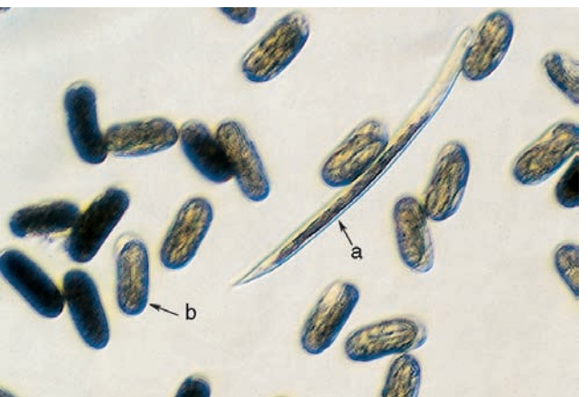
Figure 4. Second-stage juvenile (a) hatched from eggs (b). The juvenile infects the roots. Magnified 500 times.

The number of juveniles entering the plant root soon after plant emergence can have a dramatic effect on plant growth and development. Plant damage occurs from juvenile feeding, which removes cell materials and disrupts the vascular tissue. In short, SCN infection inhibits the growth and functioning of the soybean root system, interfering with nutrient and water uptake. SCN infection can also reduce nodule formation by nitrogen-fixing bacteria and can increase plant damage when other plant pathogens are present in the soil.