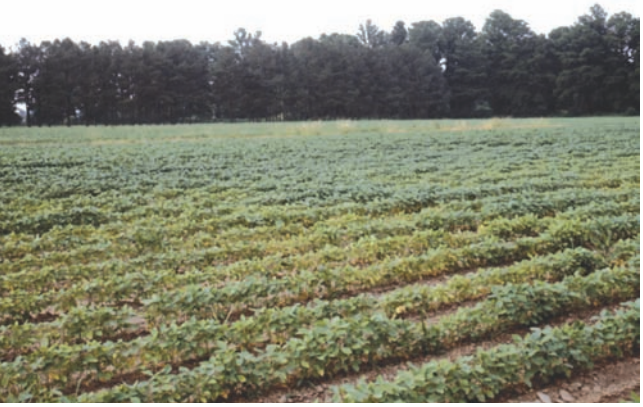
Figure 2. Stunted, yellow soybean plants (foreground) are a sign of infection by soybean cyst nematode.

Note: Do not rely on visual inspection for diagnosis, because once the cysts have matured, they turn brown and fall off the roots.