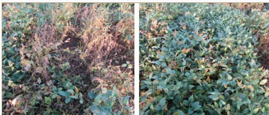
Figure 2. Soybeans treated with FST/IST (left) and FST/IST + ILeVO fungicide (right) at a research location with SDS near Lawrence, KS in August 2014.