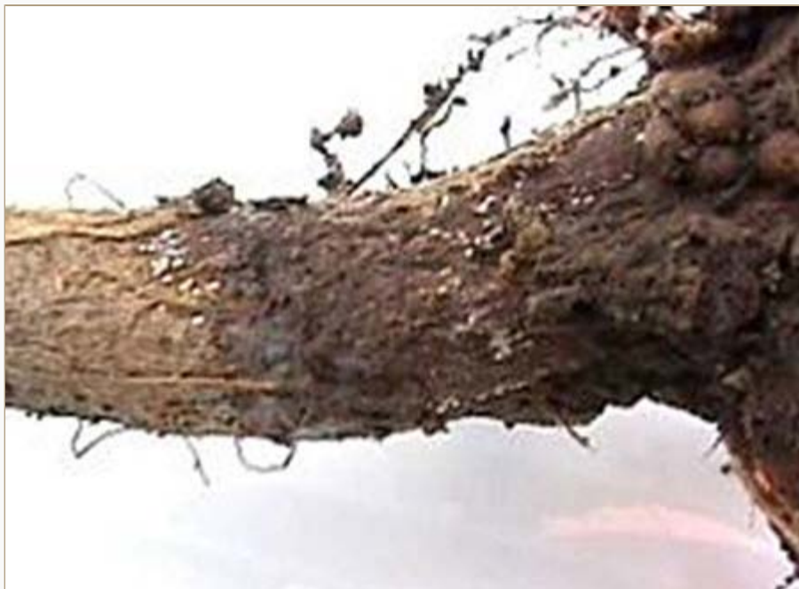
SDS-infected stem and root. Note blue mold at soil line.

SDS begins as a root disease that limits root development and deteriorates roots and nodules, resulting in reduced water and nutrient uptake by the plant. On severely infected plants, a blue coloration may be found on the outer surface of tap roots due to the large number of spores produced. However, these fungal colonies may not appear if the soil is too dry or too wet. Splitting the root reveals that the cortical cells have turned a milky gray-brown color while the inner core, or pith, remains white. The general discoloration of the outer cortex can extend several nodes into the stem, but its pith also remains white.