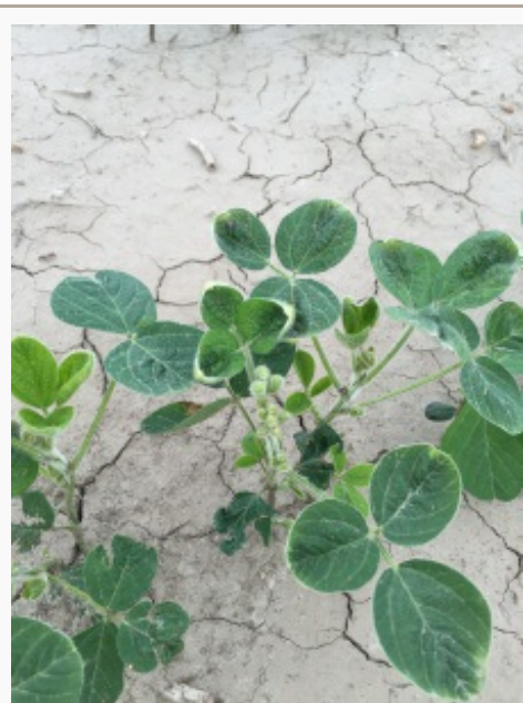
Dicamba injury on soybean.

The Weed Control Guidelines for Mississippi (MSU-ES Publication 1532) lists 56 formulations of 2,4-D that are labeled for application in the state. Many of these are only labeled for application to turf, ornamentals, forages, etc. However, there are a multitude of 2,4-D formulations labeled for application to agricultural fields. Agricultural 2,4-D products can be formulated as acid, amine, or ester formulations.