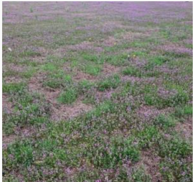
Field where no burndown has been applied in 2015.

Glyphosate plus 2,4-D at 0.5 to 1.0 lb AE/A. Close attention should be given to 2,4-D formulation, application rate, and actual planting date. See the below article.