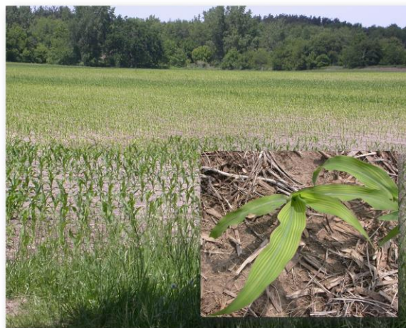
Fig. 4. Areas of sulfur deficiency (pale green) and sufficiency (dark green) in an Indiana corn field caused by variations in soil properties. Young corn that is sulfur deficient may show striping as well as an overall yellow color.